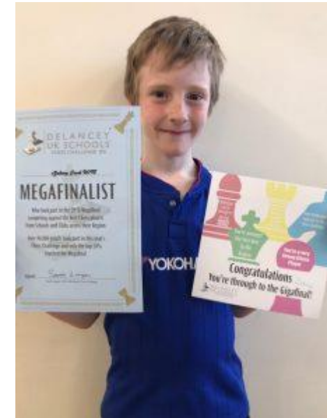
Players scoring 3.5 or more qualify for the Gigafinals (semi-finals)